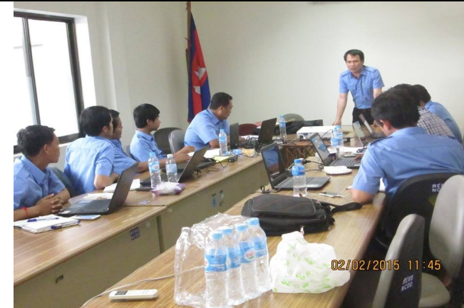
Animal Health Staffs meeting